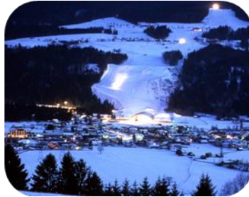
Nassfeld by night