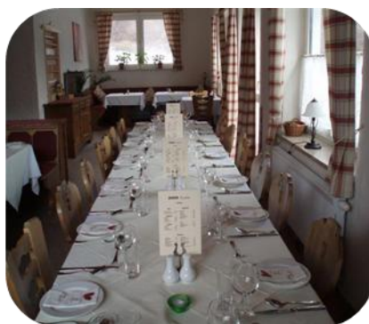
Chalet dining room