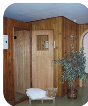
Some like it hot...