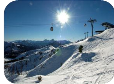
Linked ski area

Five cable cars, three six-seater chair lifts, four four-seater chair lifts and 18 drag lifts add up to a capacity of 44,000 people per hour. Queues at the lifts? Not in Nassfeld!