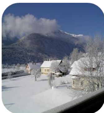
View from your balcony!