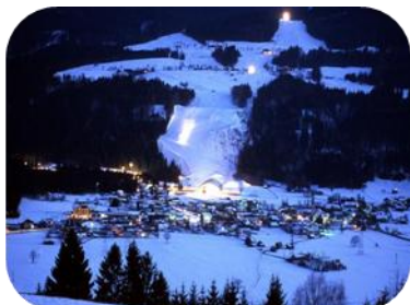
Nassfeld by night

This is one of our most popular lodges. New Carinthia Lodge has all the right ingredients for a fantastic winter holiday and with catered holidays starting at £260/person it's easy to see why! Please see page 4 for dates and prices. You can enquire about availability for your dates by contacting our sales office on bookings@boardnlodge.com